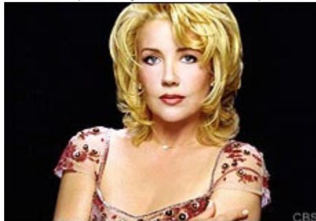
NIKKI NEWMAN (Melody Thomas Scott)

Member of Board of Directors at Jabot Cosmetics and mother of Victoria and Nicholas Newman.