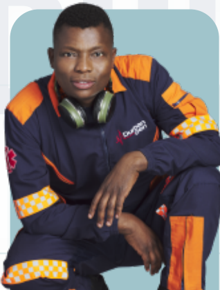
Paramedic MC Gyver

The matron is the individual who is in charge of all the nurses.