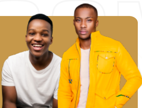
11.THE PRODIGAL SONS RETURN