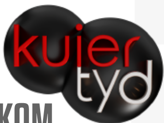
17.KOM KUIER SAAM