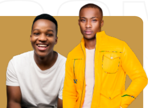
11.THE PRODIGAL SONS RETURN